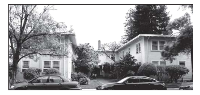
332 Forest Avenue